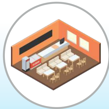
Food and Beverage